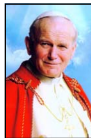
Blessed John Paul II 7 November 2001 http://www.vatican.va/holy_father/john_paul_ii/audiences/2001/documents/hf_jp-ii_aud_20011107_en.html

not praise?... Absolutely not. You will not be so ungrateful. To him are owed honour, respect and the greatest praise ... Listen to the Psalm: "All the earth, cry out with joy to the Lord". Then you will understand the joy of all the earth if you rejoice before the Lord" (From the Exposition on the Psalms, Italian version, Esposizioni sui Salmi III/1, Rome 1993, p. 459).