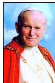
Blessed John Paul II 25 April 2001 http://www.vatican.va/holy_father/john_paul_ii/audiences/2001/documents/hf_jp-ii_aud_20010425_en.html