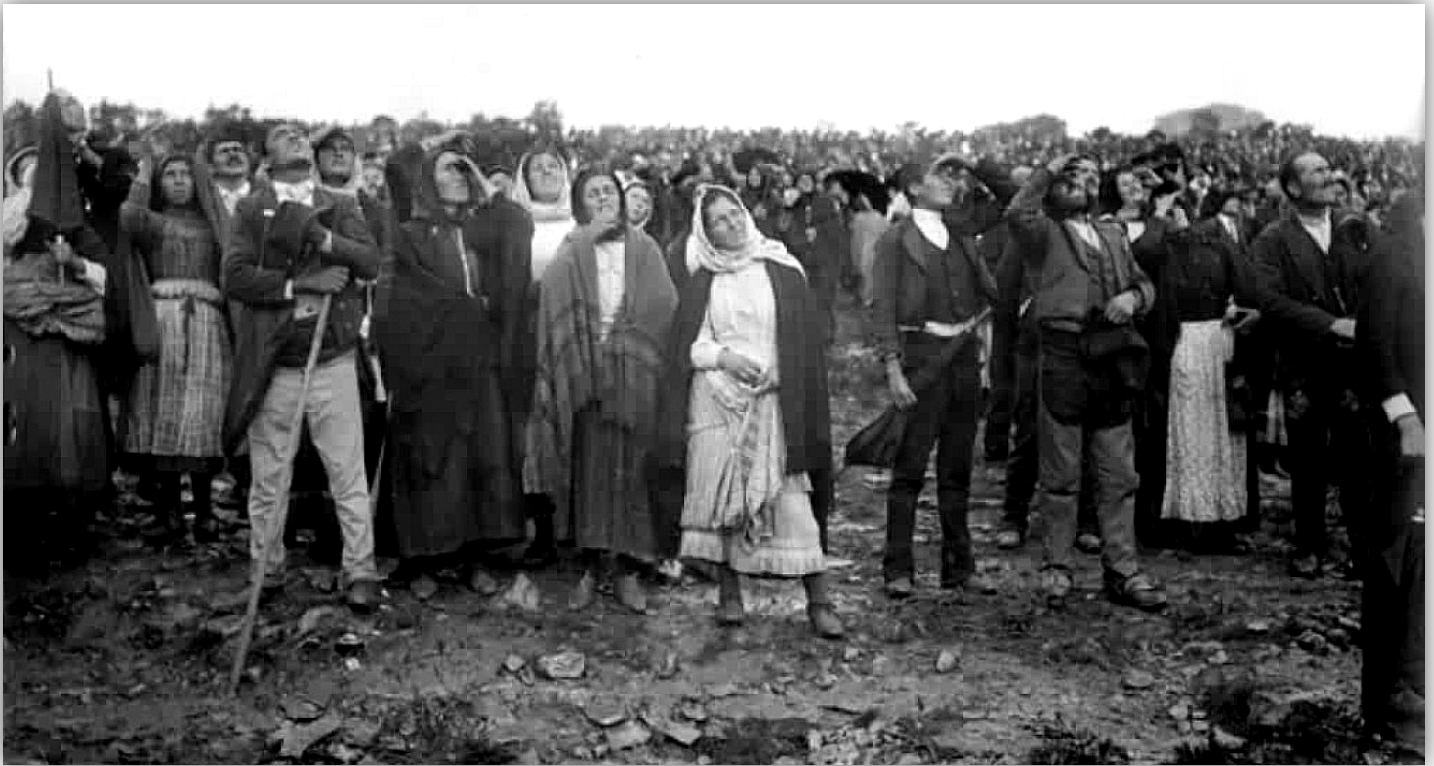
70,000 people witnessed the "Miracle of the Sun." As stunning as it was Our Lady said it was not as great because of the arrest of the children in August that kept them from coming to the cova.

for sins. She exhorted the Church to pray and offer sacrifices to God in order that peace may come upon the world, and that the trials may be averted.